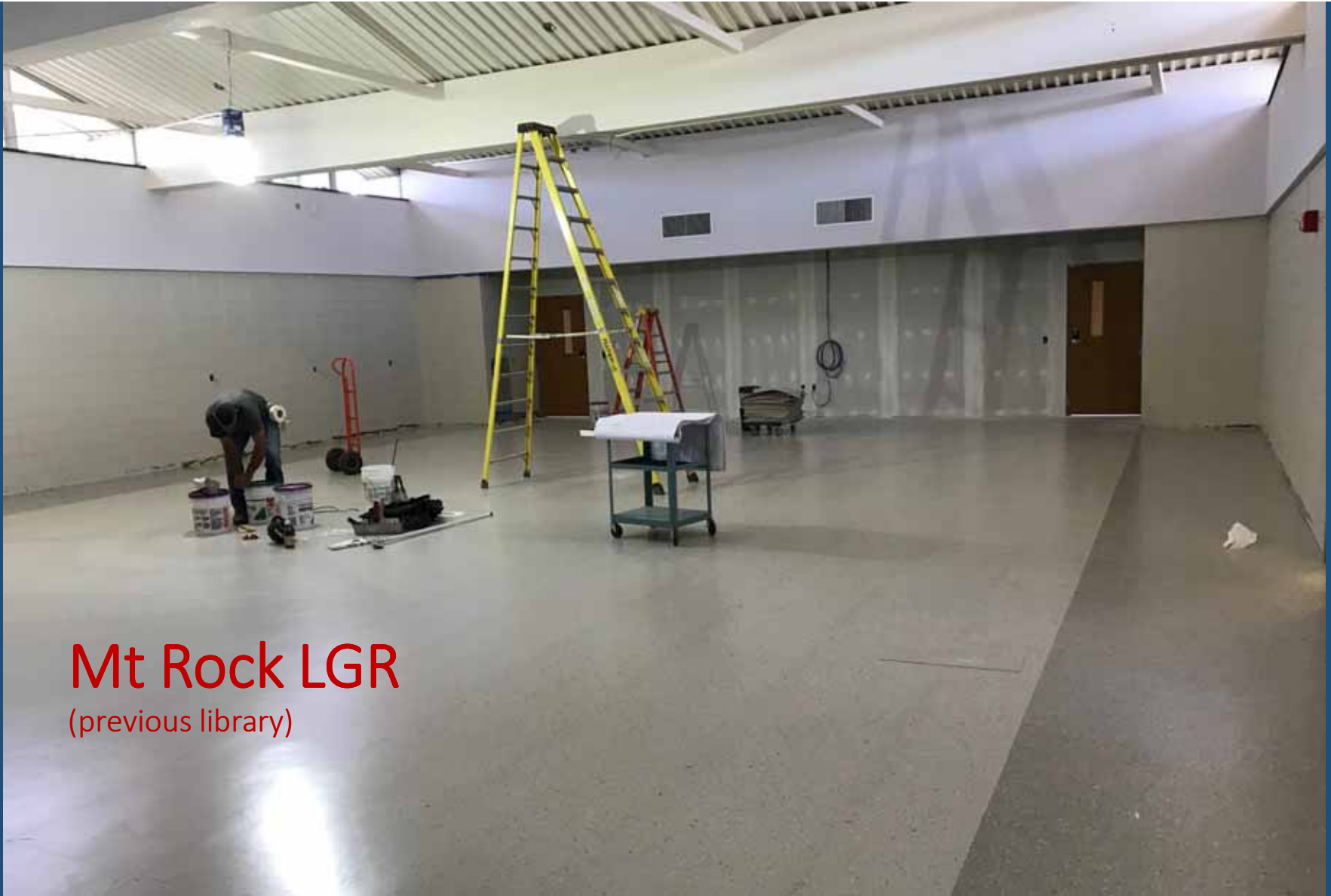
Mt Rock LGR (previous library)