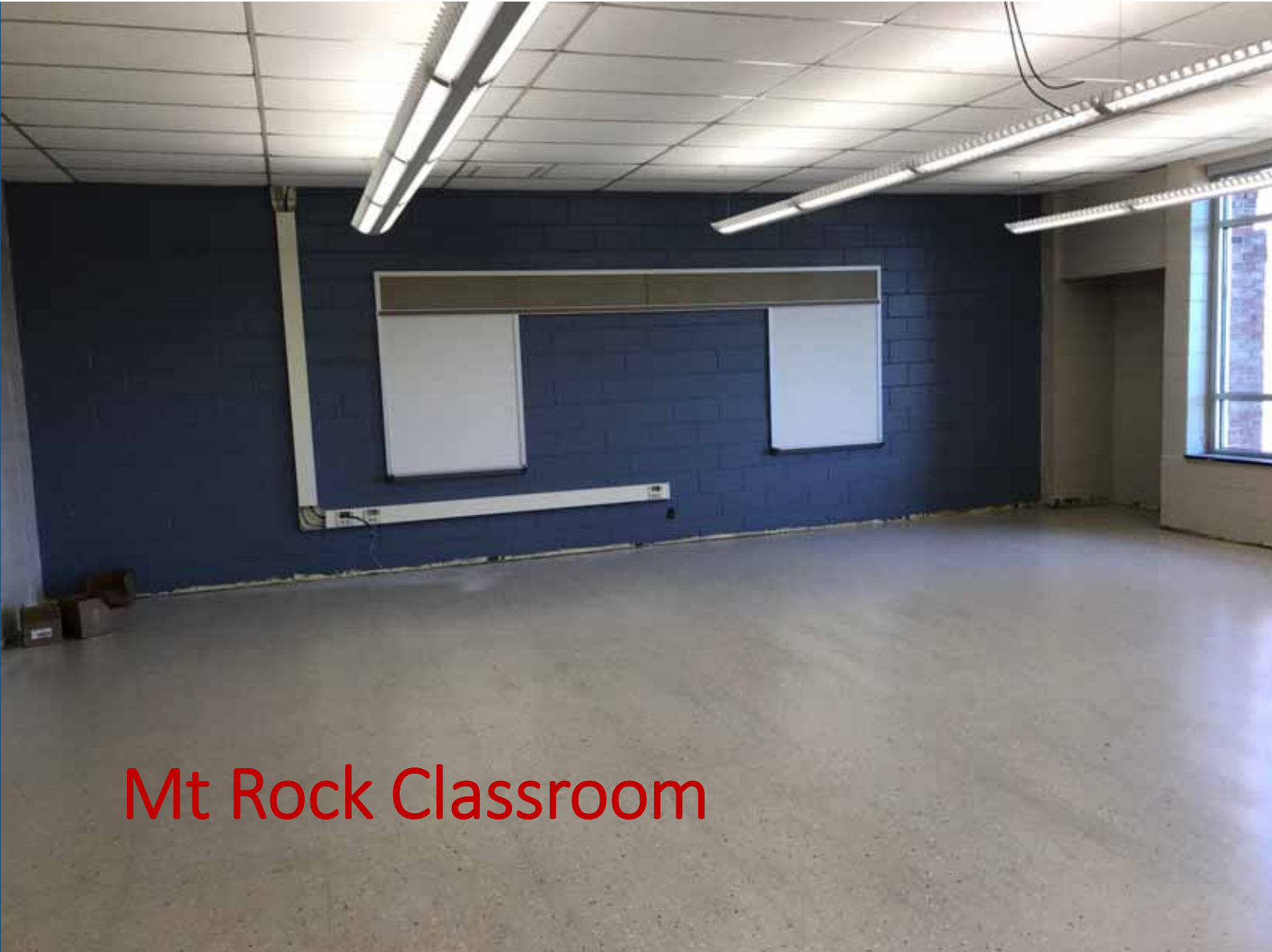
Mt Rock Classroom