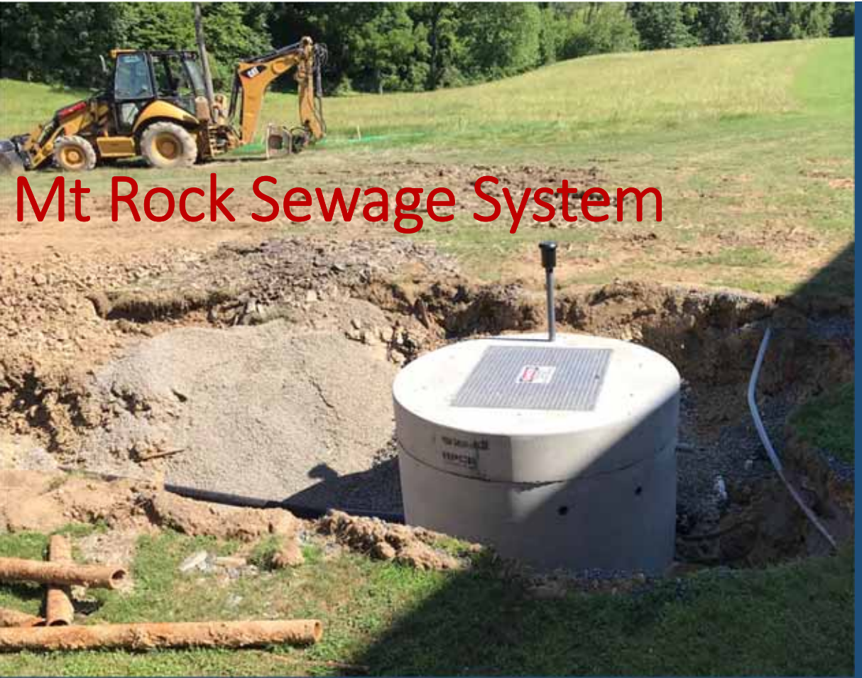
Mt Rock Sewage System