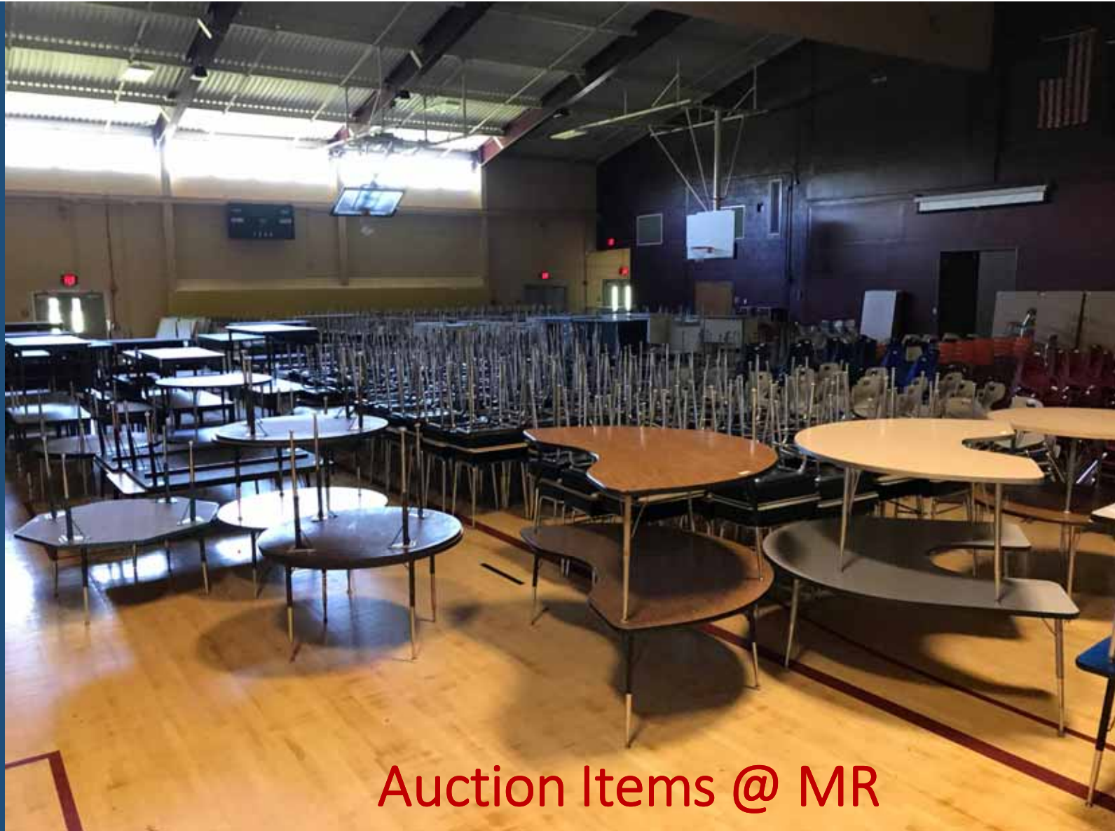
Auction Items @ MR