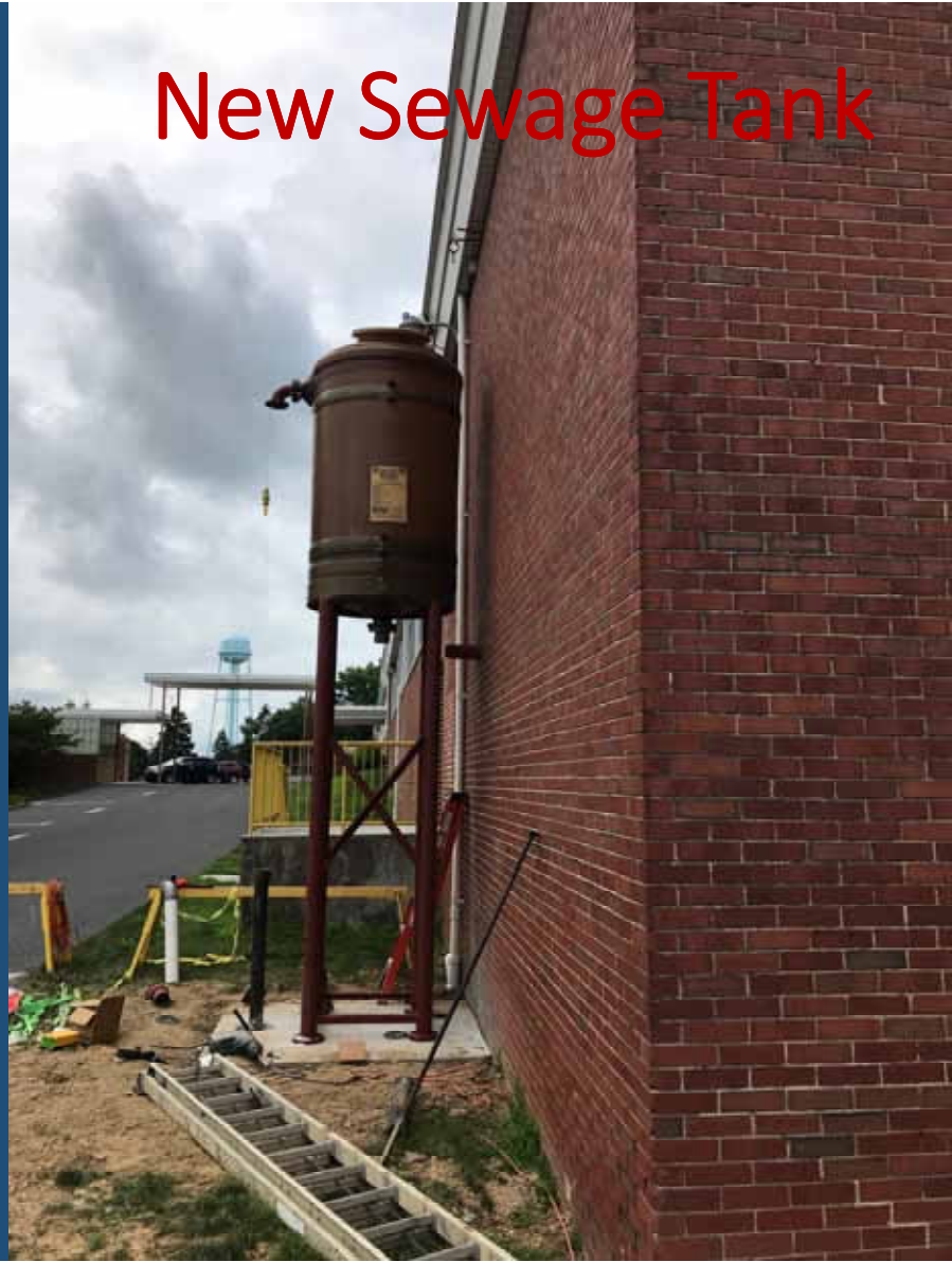
New Sewage Tank