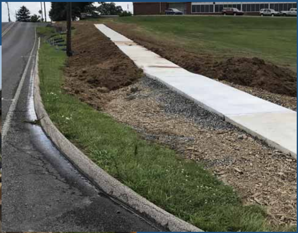
Mt Rock Sidewalks