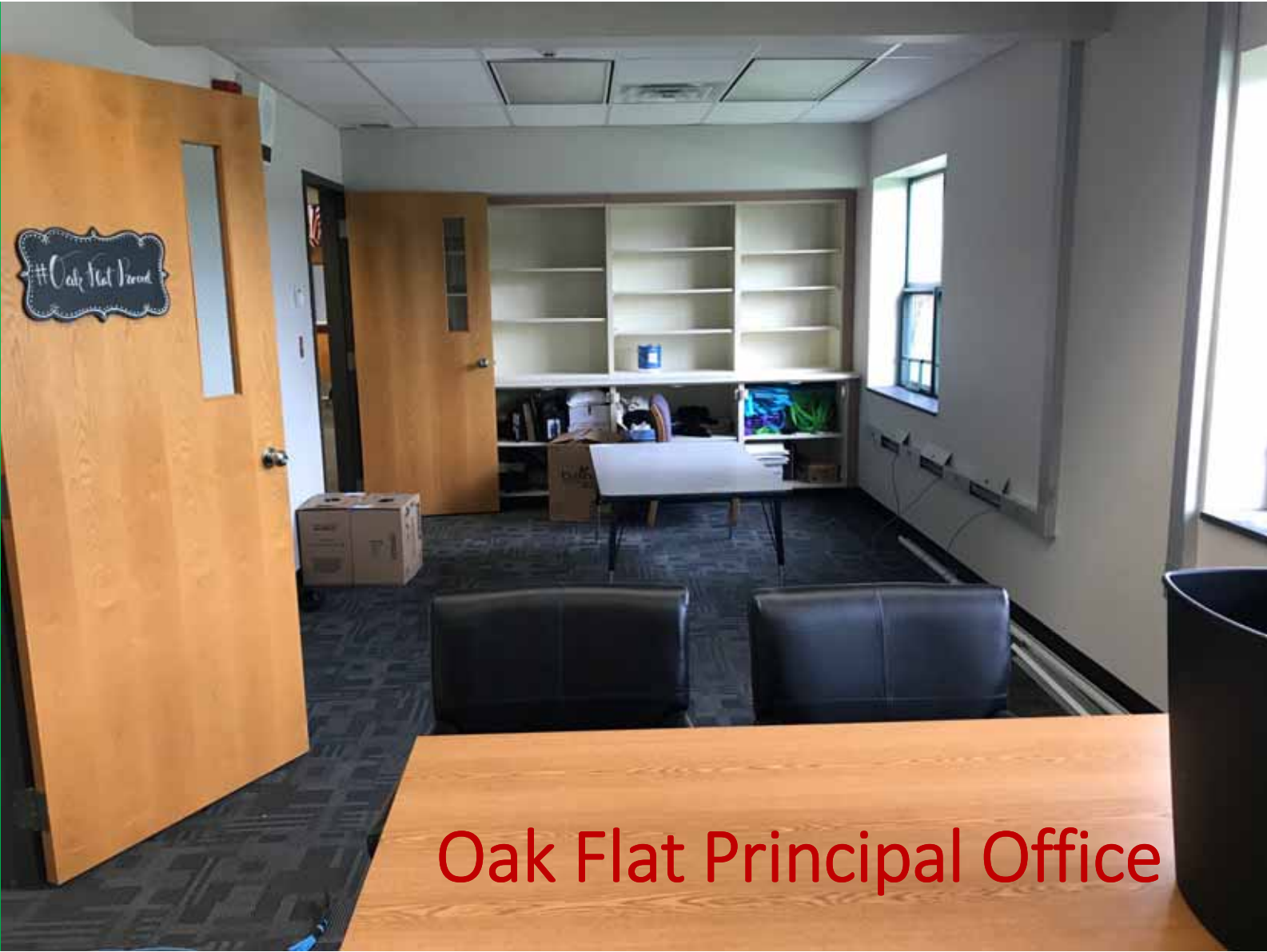
Oak Flat Principal Office