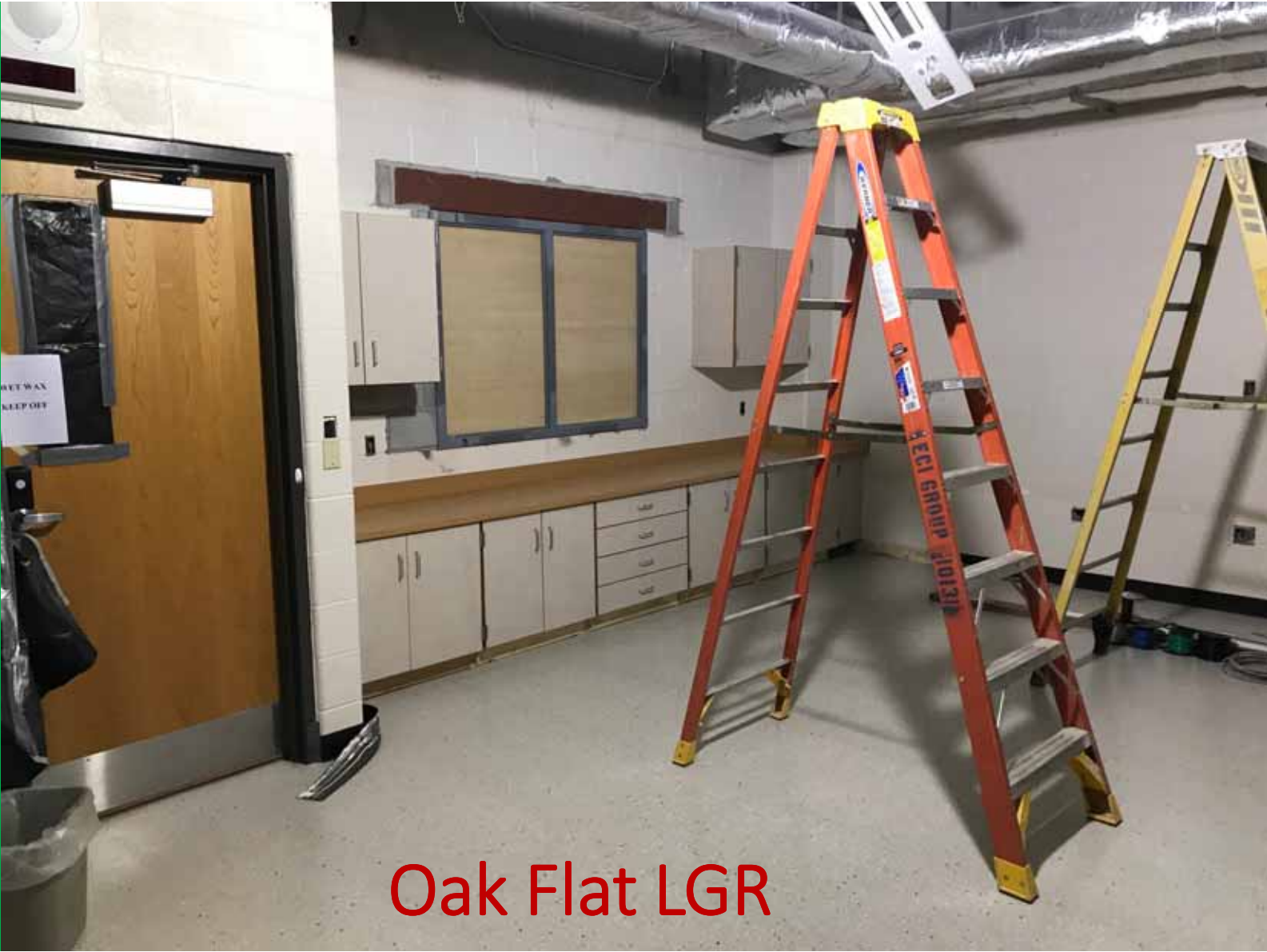
Oak Flat LGR