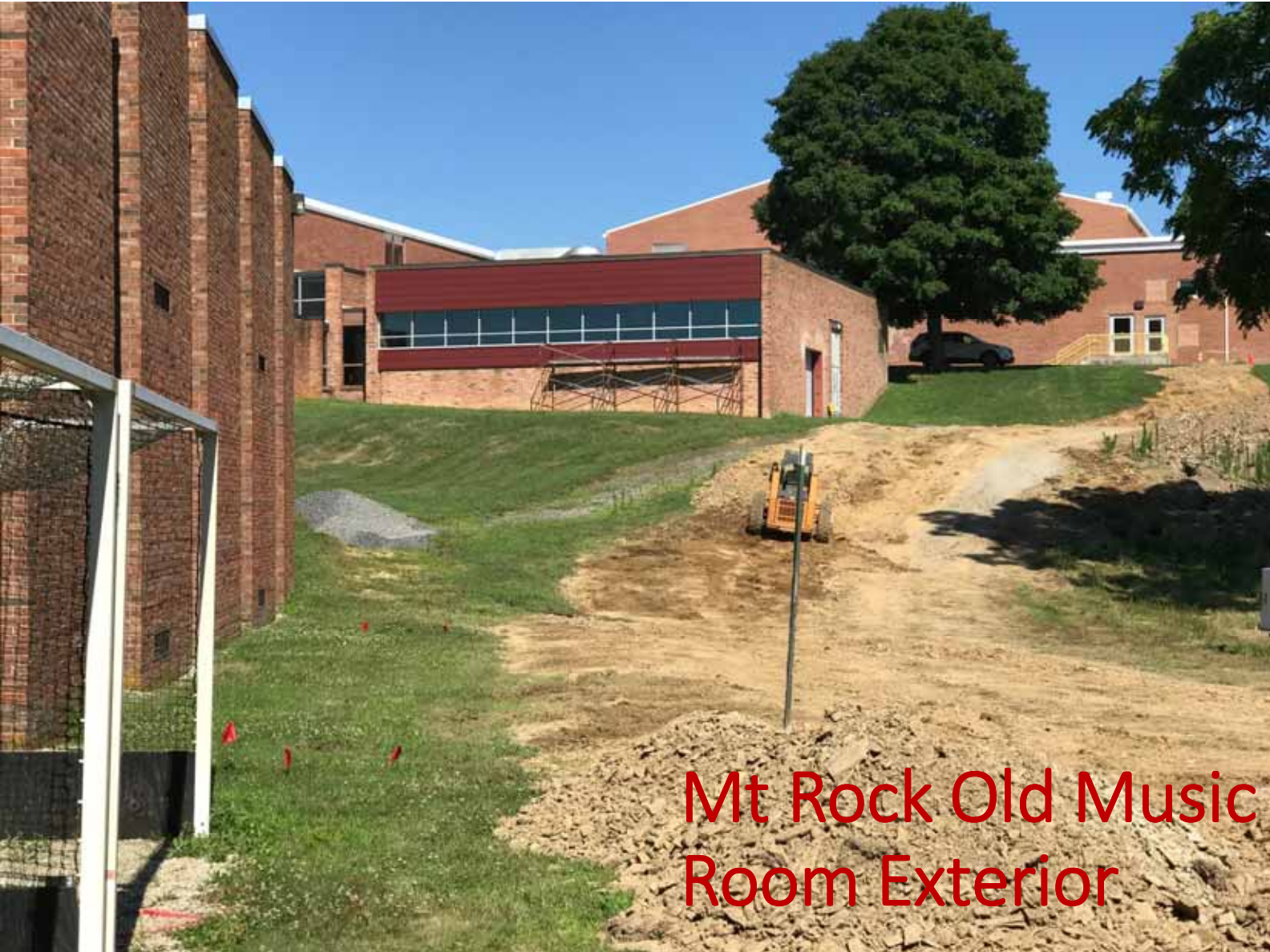
Mt Rock Old Music Room Exterior