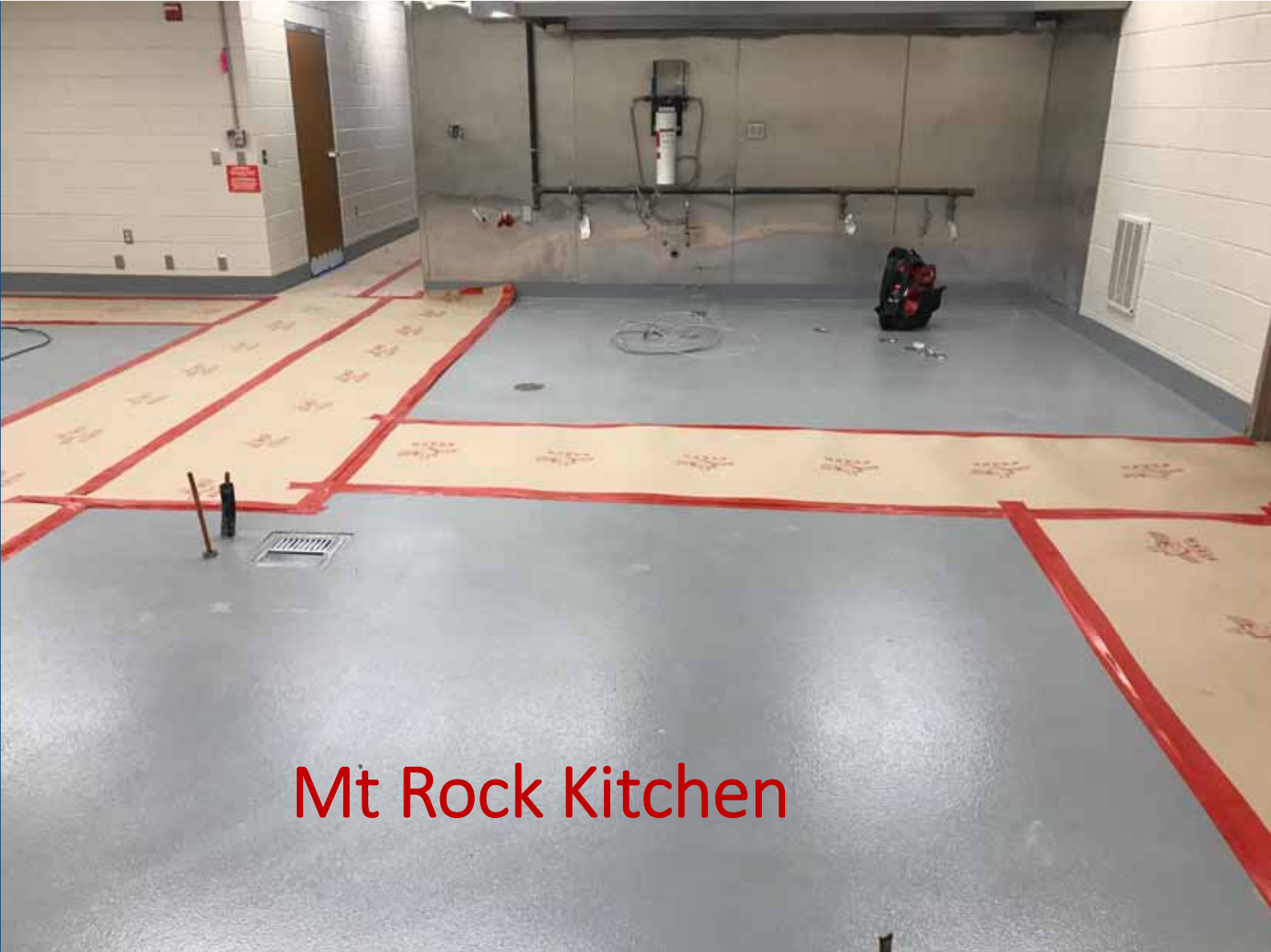
Mt Rock Kitchen